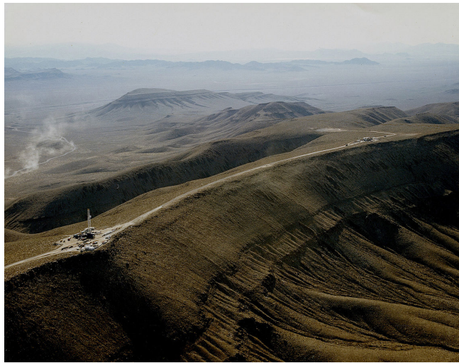
The crest of Yucca Mountain.